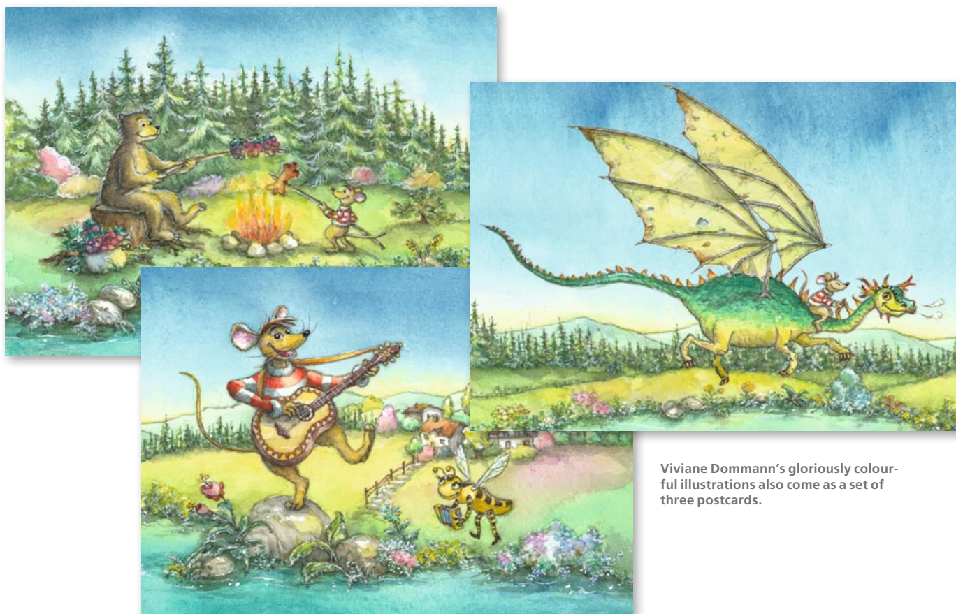
Viviane Dommann's gloriously colourful illustrations also come as a set of three postcards.